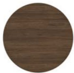
Modern Walnut (MWN)