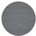
Newport Grey (NPG)